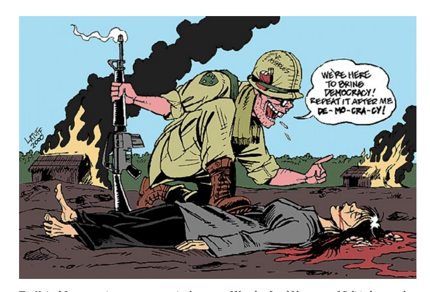
The United States continues to wage war in the name of "freedom" and "democracy." Political cartoon by Carlos Latuff.

We keep wanting to have stuff translated ... tools to help educate folks about U.S. history ... more multimedia stuff, like a [subtitled] Malcolm X speech... It's just much more powerful when people can see images... We print out black-and-white photos from our printer; that's as lively as it gets... Having some of those media tools would be useful ... condensed, concise analysis