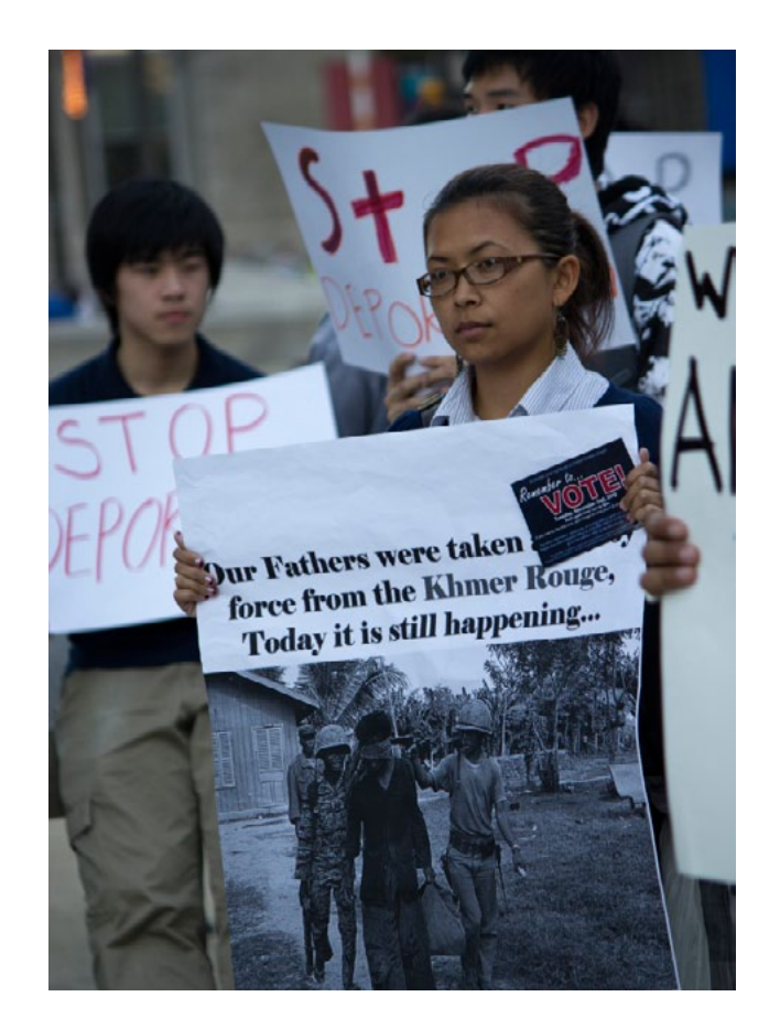
Khmer community members protesting mandatory detention and deportation.

One of the challenges that I face is the racism within our community... While we are a Sikh organization ... [that] is facing ... discrimination due to Islamophobia, because of mis-identity ... within our communities, they too are also reproducing Islamophobic sentiment. And their sentiment is, "We are not Muslim... We are the victims... We didn't do anything, but the Muslims did." ...despite the issues