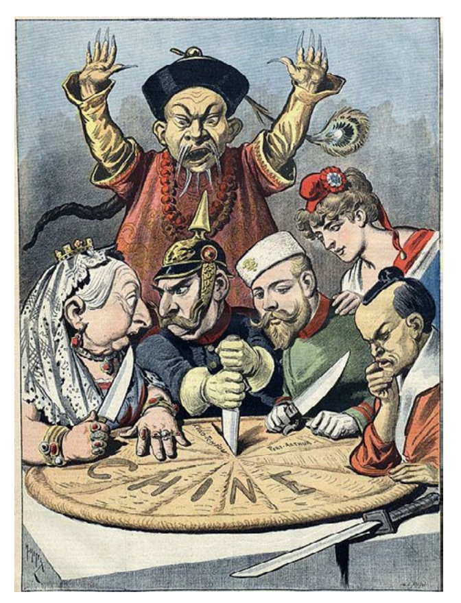
The racialization of Asian Americans is rooted in the "us-versus-them" thinking that justifies western imperialism and war.

Several informants said that while the structural problems facing Asian American communities were deep and complex, the newness of those communities meant that their politics were still developing: