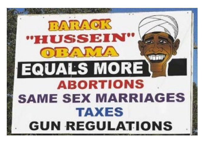
A rightwing billboard in Missouri uses an Islamophobic caricature of Barack Obama wearing a turban to drum up white resentment.

Asian American assertions of racial justice increasingly reject not only anti-Black racism, but