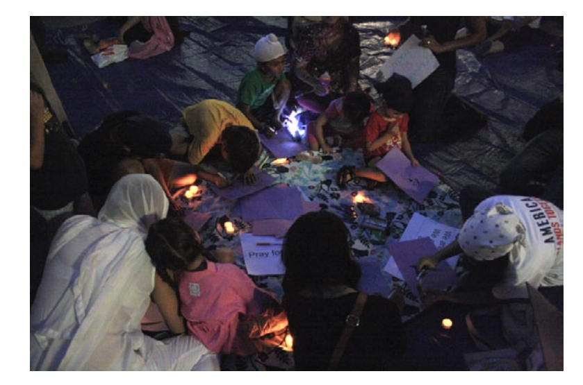
Community members gather to support victims of the deadly white supremacist shooting at a gurdwara in Oak Creek, Wisconsin last year.

In New Orleans, post-Katrina, DEA (Drug Enforcement Agency) really came in and did this targeted enforcement around the drug war and Black folks were selling crack, the Vietnamese were funneling in Ecstasy from Canada, and the Latinos were bringing in