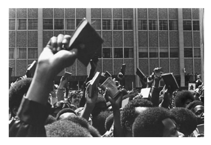
Black Panther supporters hold up Mao's Red Book, Oakland 1969.

Among Asian American participants, when asked how they got involved in racial justice work and where their race politics came from, by far the strongest theme was college. Fully 60% of participants said that college was critical in the development of their race analysis. The only real demographic difference was that U.S.-born people were more likely to follow the college model than immigrants (67% versus 46%). Notably, only two people in the entire study — both Asian