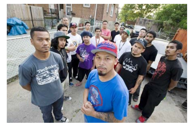
Members of One Love Movement, founded by Khmer organizers in Philadelphia to oppose mandatory detention and deportation for those with criminal convictions.

Ironically, while Asians are very underrepresented in the [California] Trial Court level and the next level, Appellate Court, we're actually overrepresented in the Supreme Court. [Asians] actually have a majority in the Supreme Court! To try to deal with the issue ... if you have Asians there, [and] if that displaces other minorities, then how do you try