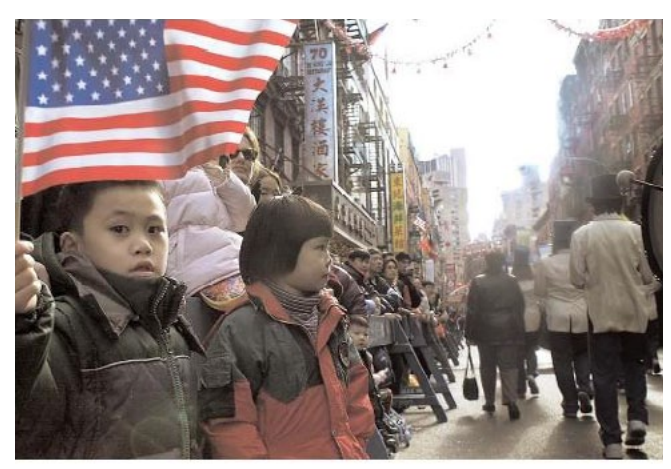
We heard that many first-generation, low-income Asian Americans in urban area remain largely invisible to the racial justice movement.

all the different ways that communities have been displaced. It's not just about free trade; it's not just about cheap corn imports. There's also other parts of the story that are important as well.