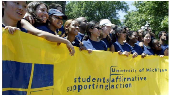
Asian American and other students demonstrating support for affirmative action policies at the University of Michigan.

Since 2000, the number of hate groups has increased by 69 percent. This surge has been fueled by anger and fear over the nation's ailing economy, an influx of non-white immigrants, and the diminishing white majority... These factors also are feeding a powerful resurgence of the antigovernment "Patriot" movement, which in the 1990s led to a string of domestic terrorist plots, including the Oklahoma City bombing. The number of Patriot groups, including armed militias, grew by 755 percent in the first three years of the Obama administration — from 149 at the end of 2008 to 1,360 in 2012.