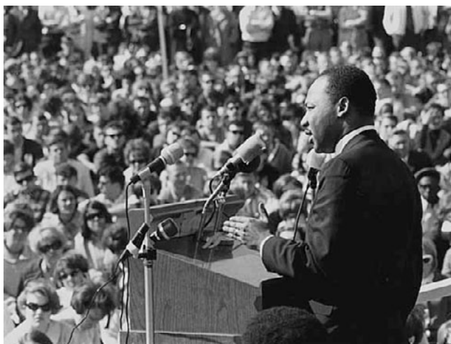
Dr. Martin Luther King, Jr. gave a powerful speech in 1967 called "Beyond Vietnam" connecting U.S. racism to poverty and war. He would lose major political support because of it, from President Johnson to major newspapers, and in popular polls.