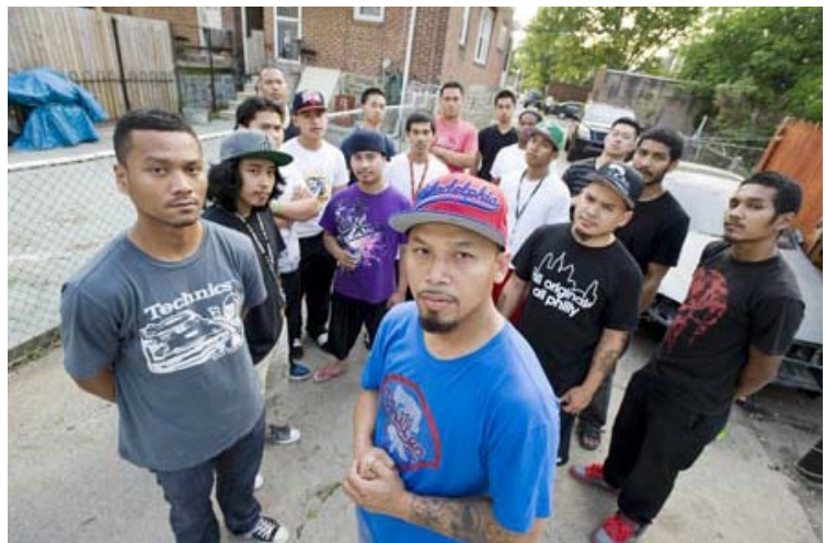
Members of One Love Movement, founded by Khmer organizers in Philadelphia to oppose mandatory detention and deportation for those with criminal convictions.

Ironically, while Asians are very underrepresented in the [California] Trial Court level and the next level, Appellate Court, we're actually over-represented in the Supreme Court. [Asians] actually have a majority in the Supreme Court! To try to deal with the issue ... if you have Asians there, [and] if that displaces other minorities, then how do you try