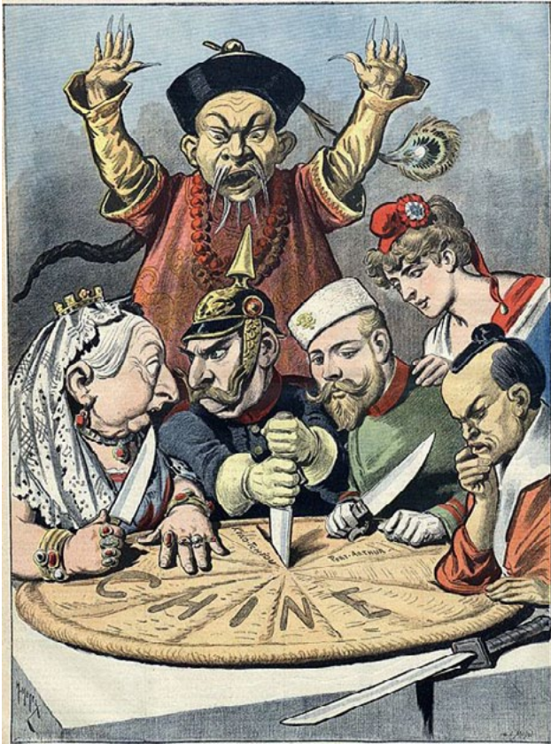
The racialization of Asian Americans is rooted in the "us-versus-them" thinking that justifies western imperialism and war.

Several informants said that while the structural problems facing Asian American communities were deep and complex, the newness of those communities meant that their politics were still developing: