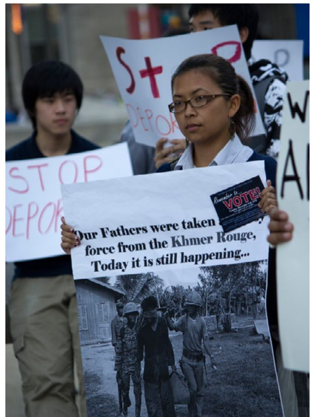
Khmer community members protesting mandatory detention and deportation.

One of the challenges that I face is the racism within our community... While we are a Sikh organization ... [that] is facing ... discrimination due to Islamophobia, because of mis-identity ... within our communities, they too are also reproducing Islamophobic sentiment. And their sentiment is, "We are not Muslim... We are the victims... We didn't do anything, but the Muslims did." ...despite the issues