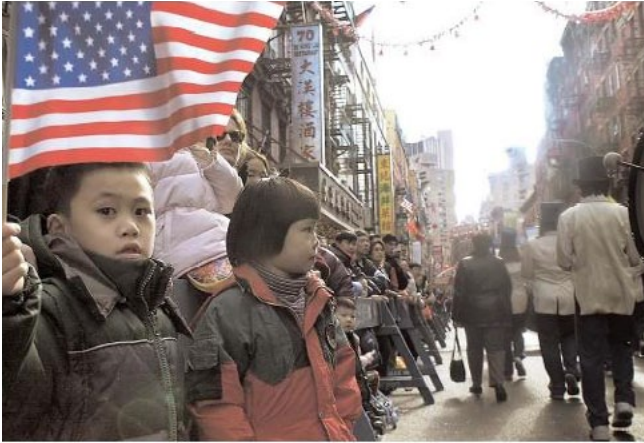
We heard that many first-generation, low-income Asian Americans in urban area remain largely invisible to the racial justice movement.

all the different ways that communities have been displaced. It's not just about free trade; it's not just about cheap corn imports. There's also other parts of the story that are important as well.