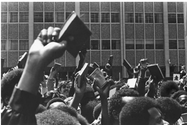
Black Panther supporters hold up Mao’s Red Book, Oakland 1969.

One participant described her political awakening during the social movements of the ’60s. “The Black Panthers and their arrival into Chinatown and their organizing efforts, the seeds that they planted were very powerful,”