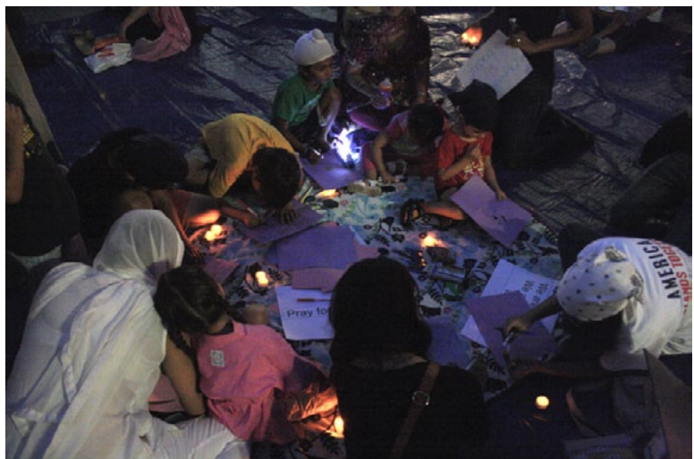
Community members gather to support victims of the deadly white supremacist shooting at a gurdwara in Oak Creek, Wisconsin last year.

In New Orleans, post-Katrina, DEA (Drug Enforcement Agency) really came in and did this targeted enforcement around the drug war and Black folks were selling crack, the Vietnamese were funneling in Ecstasy from Canada, and the Latinos were bringing in